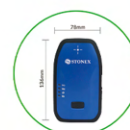
High precision positioning in a small space

IMUs are sensors that utilize a combination of accelerometers, gyroscopes, and magnetometers to accurately track movement and orientation. These advanced sensors offer a valuable solution for surveying in difficult or inaccessible locations where traditional methods may not be practical. Furthermore, IMUs significantly enhance the accuracy of GNSS positioning by providing inertial measurements that can be used to correct for GNSS signal errors and provide more precise positioning, particularly in areas with limited satellite coverage. The S580+ model, for instance, can measure inclinations up to 60 degrees.