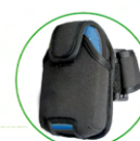
Hands free design